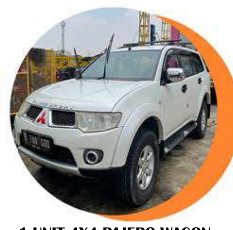
1 UNIT 4X4 PAJERO WAGON