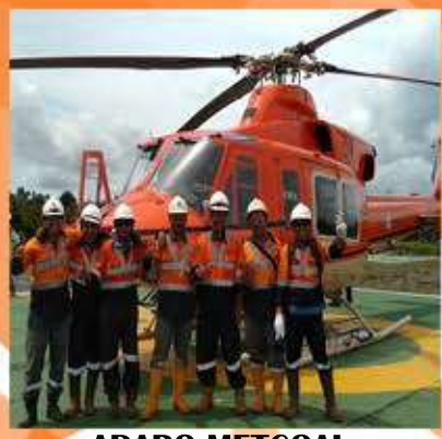
ADARO METCOAL MOVING RIG BY CHOPPER