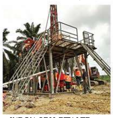
INDON CBM PTY LTD. CBM DRILLING