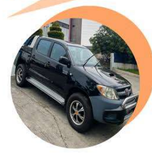
1 UNIT MITSUBISHI CABIN