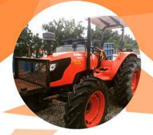
4 UNITS TRACTOR TRUCK TO SUPPORT MOVING ACTIVITIES