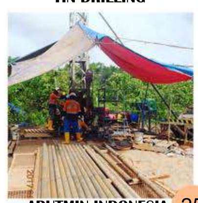
ARUTMIN INDONESIA COAL DRILLING