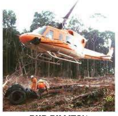
BHP BILLITON MOVING RIG BY CHOPPER