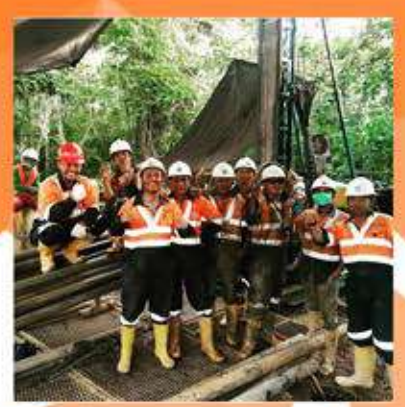
MEDCO ENERGY OIL DRILLING