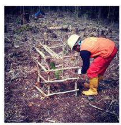
BHP BILLITON REHABILITATION