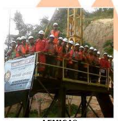
LEMIGAS CBM DRILLING