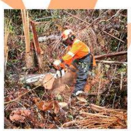
BHP BILLITON ACCESS PREPARATION