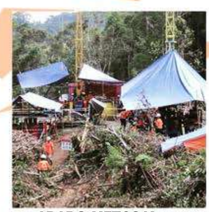
ADARO METCOAL COAL DRILLING