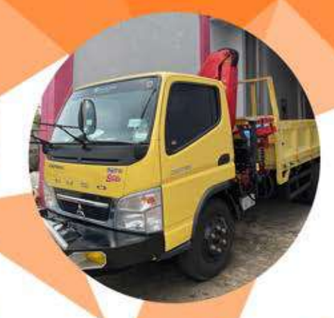
1 UNIT CRANE TRUCK